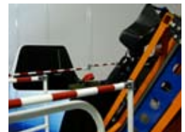
SEAT SLED WITH CATAPULT MOUNT