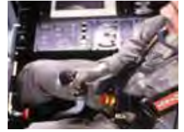
HIGH FIDELITY COCKPIT

For various research applications, the GL-1500 provides a complete medical monitoring system with CCTV and voice communication systems. The user-friendly data acquisition system and storage program provides an ideal way to keep track of all test data collected, for further use.